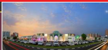
Thumbyay Hospital AJMAN