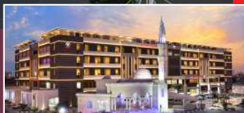
Thumbyay University Hospital AJMAN