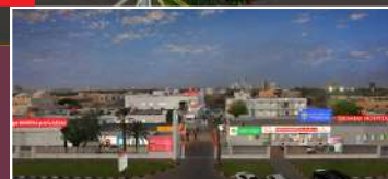
Thumbyay Hospital FUJAIRAH