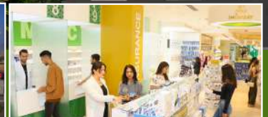
Thumbay Pharmacy UAE