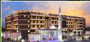
Thumbay University Hospital AJMAN