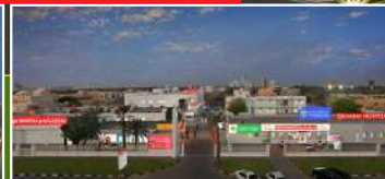
Thumbay Hospital FUJAIRAH