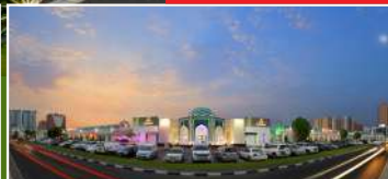
Thumbay Hospital AJMAN