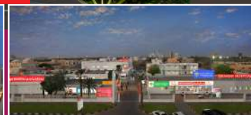
Thumbay Hospital FUJAIRAH