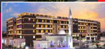
Thumbay University Hospital AJMAN