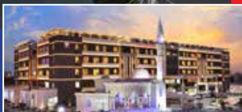
Thumbay University Hospital AJMAN