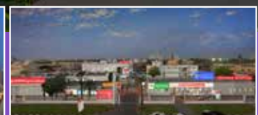
Thumbay Hospital FUJAIRAH