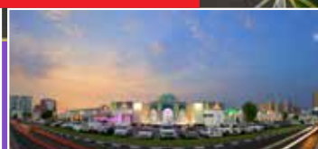
Thumbay Hospital AJMAN