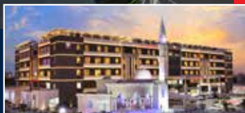
Thumbay University Hospital AJMAN