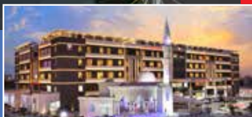
Thumbay University Hospital AJMAN