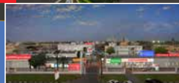
Thumbay Hospital FUJAIRAH