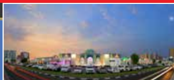
Thumbay Hospital AJMAN