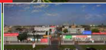
Thumbay Hospital FUJAIRAH