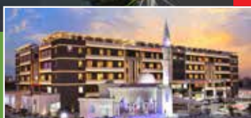
Thumbay University Hospital AJMAN