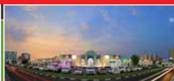
Thumbay Hospital AJMAN