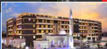
Thumbay University Hospital AJMAN