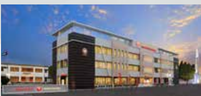
THUMBAY DENTAL HOSPITAL