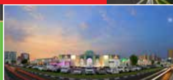
Thumbay Hospital AJMAN