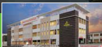
Thumbay Physical Therapy & Rehabilitation Hospital, Ajman