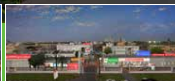
Thumbay Hospital FUJAIRAH