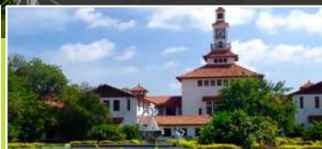
University of Ghana ACCRA - GHANA