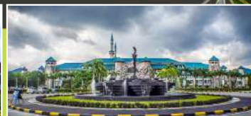
International Islamic University MALAYSIA