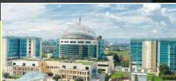
Vita-Salute San Raffaele University ITALY