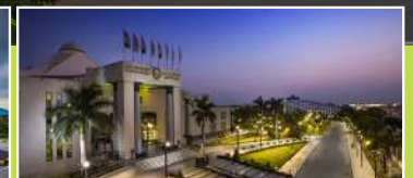
Misr University for Science and Technology, EGYPT