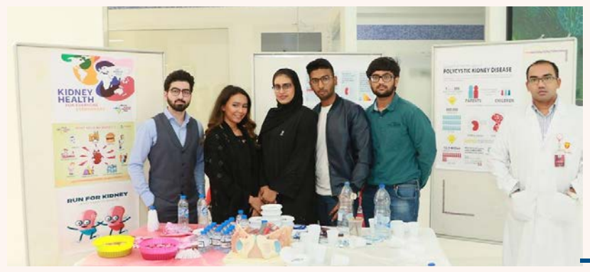
4th March-The first year medical students of College of Medicine commemorated 'World Kidney Day'

6th-7th March- UAE Pharmacy Education Summit