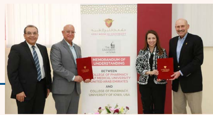
3rd March - College of Pharmacy - signed an agreement with College of Pharmacy -The University of Iowa USA

<mark>2nd March-</mark> Global day at GMU