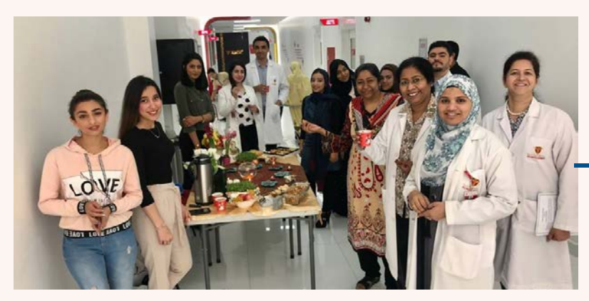
21st March- GMU students celebrated the Iranian New year Nowruz